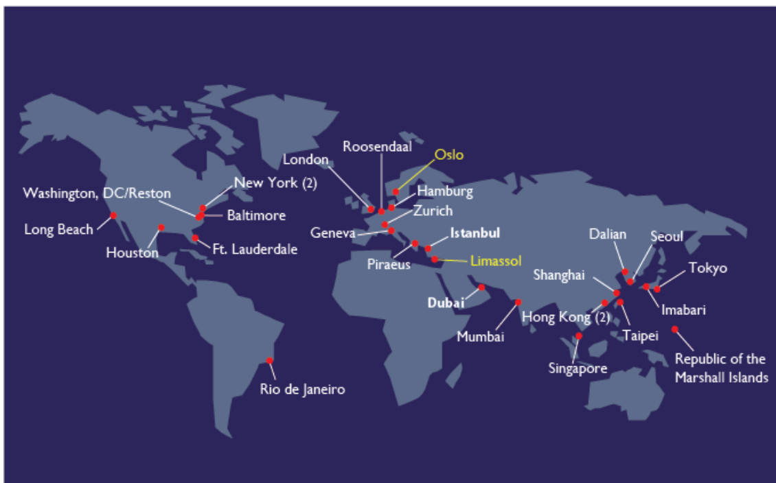
Marshall Islands Registry Branch Offices

With abundant funds and increasing ambitions to develop their business, the Marshall Islands Registry is actively expanding their footprints all over the world. They sponsor various shipping forums and functions in the major maritime hubs and financial centres to attract global attention. After the 2008 shipping crisis, for instance, the Marshall Islands Registry has speed up its pace of growth and have become even more passionate, remarkably almost half of its 27 regional offices have been set up since the year of 2008 and it seems that its efforts have paid off.