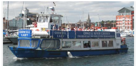
The Orwell Lady will be departing from Ipswich Wet Dock, Orwell Quay, Wet Dock, IP3 0BQ

The Orwell Lady consists of an open upper deck and an indoor saloon and there is a licensed bar on board.