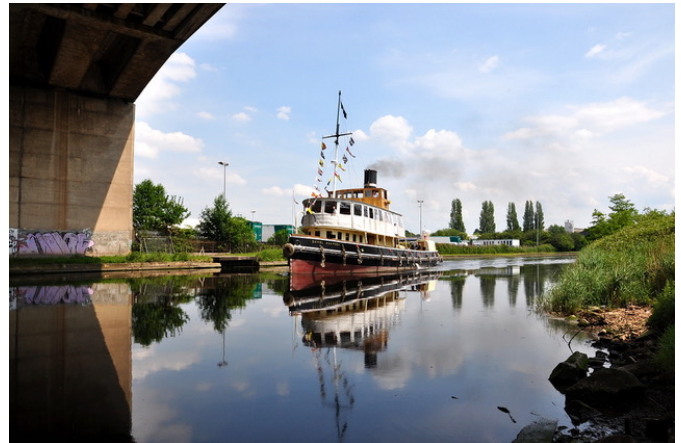
Daniel Adamson

In June we held our first Social evening aboard the Daniel Adamson. I believe the evening was an overall success with around 70 guests attending. It was our first event of this type and it brought in some new faces and raised the profile of the branch outside our usual circuit. I would like to thank all committee members who supported the event and I hope to organise another event similar to this in 2018.