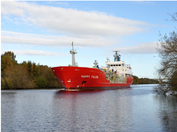
Happy Falcon on the Manchester Ship Canal

There will also be an opportunity for companies to sponsor the Dinner and details can be obtained from the Branch Secretary (contact details at the end of this Newsletter).