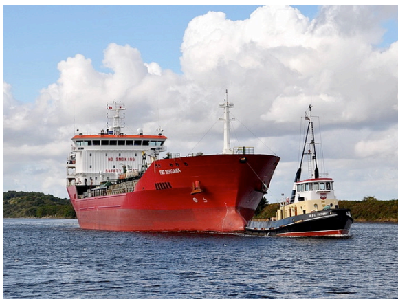
FMT Bergama in the River Mersey

International Transport Intermediaries Club (ITIC) says communications failings within shipbrokers' organisations can result in important instructions from principals being overlooked, leading to potentially costly claims.