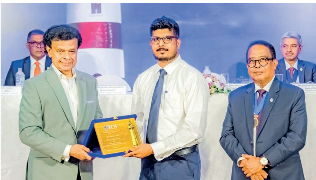
Best Shipping Agent - Customer Service - Colombo-Indian Sub Continent Trade - COSCO Shipping Lines Lanka (Pvt) Ltd