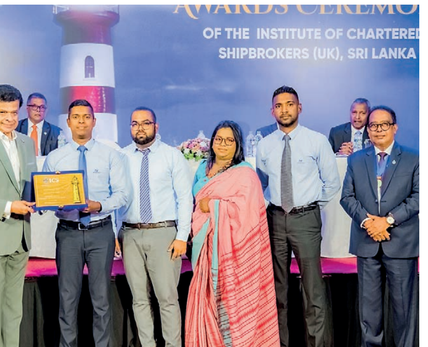
Best Shipping Agent - Customer Service - Colombo - Gulf & Red Sea Trade - McLaren's Shipping Ltd