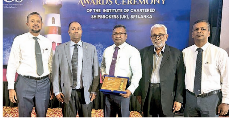
The McLarens Containers team poses with the Best Inland Container Depot – Import Category award at the 32nd Annual Awards Ceremony of the Institute of Chartered Shipbrokers (UK), Sri Lanka Branch