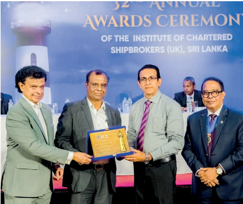
Best Inland Container Depot - Customer Service - Export Category - Spectra Integrated Logistics Ltd