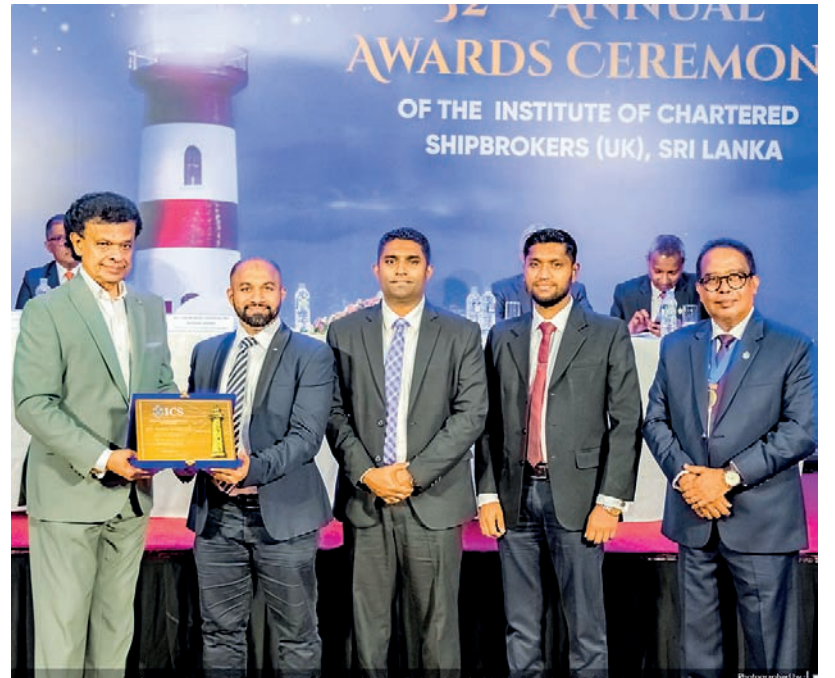
Best NVOCC Agent - Customer Service - Outbound Trade - McOcean Logistics (Pvt) Ltd