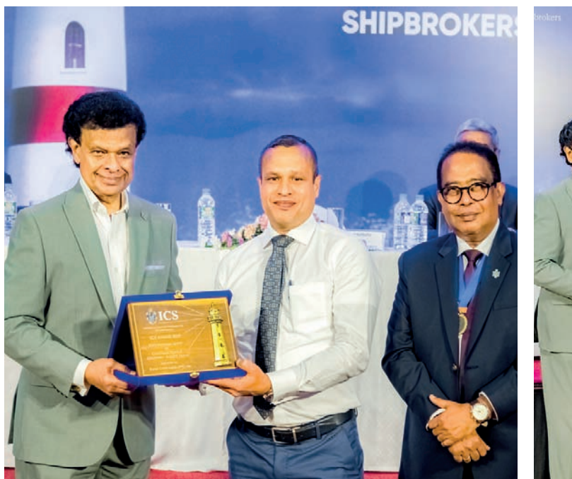
Best Shipping Agent - Customer Service - Colombo - Europe Trade - Hapag Lloyd Lanka (Pvt) Ltd