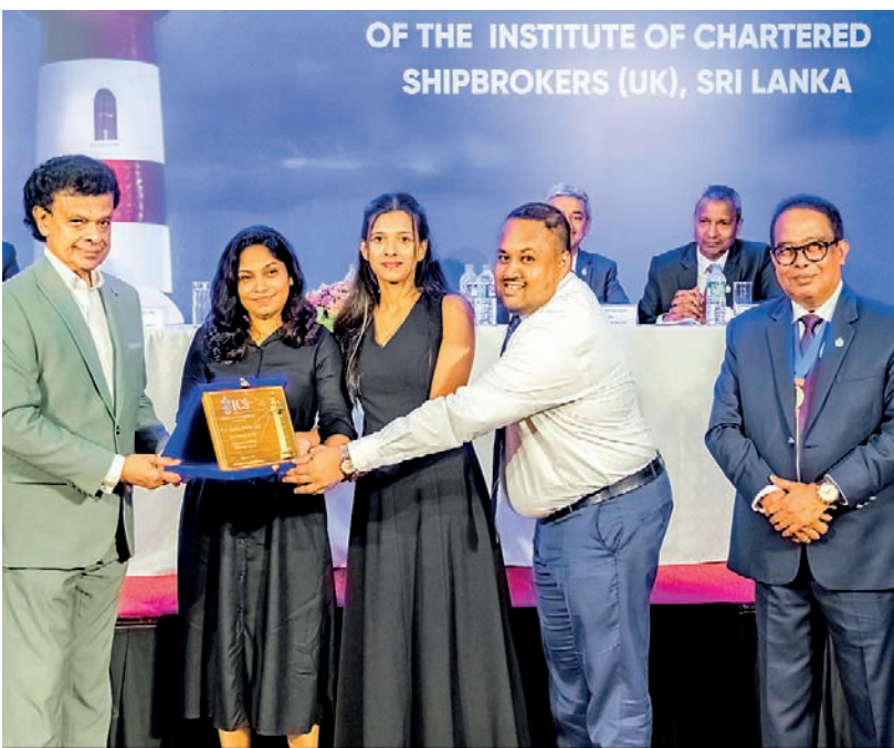
Best NVOCC Agent - Customer Service - Inbound Trade - Goodrich Lanka (Pvt) Ltd