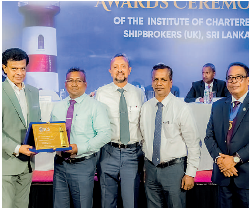
Best Inland Container Depot - Customer Service - Import Category - McLaren's Containers (Pvt) Ltd