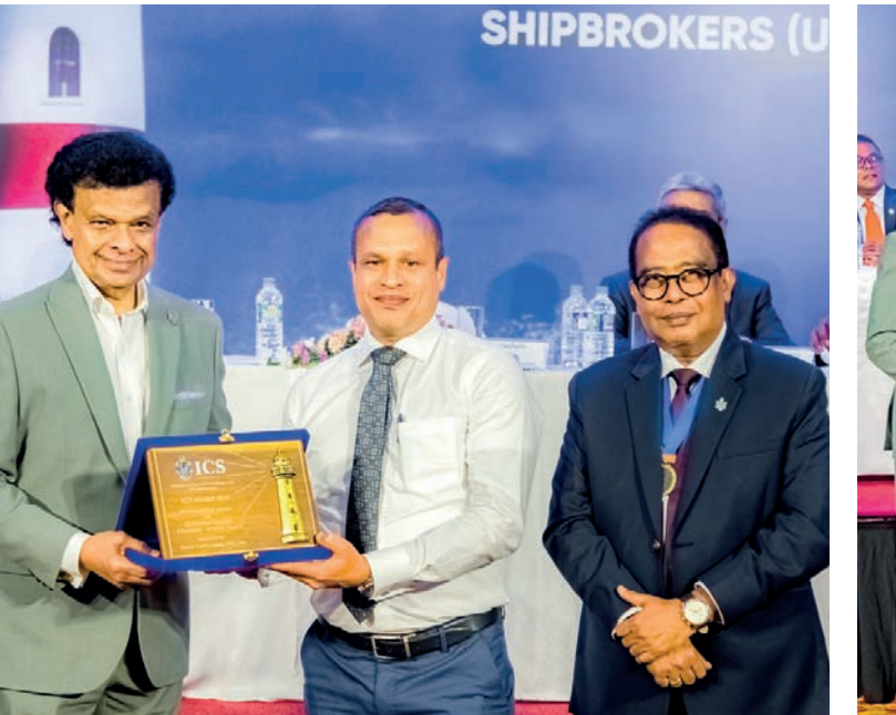
Best Shipping Agent - Customer Service - Colombo - Mediterranean Trade - Hapag Lloyd Lanka (Pvt) Ltd