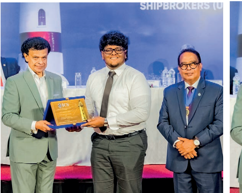
Best Shipping Agent - Customer Service - Colombo - Intra Asia Trade - COSCO Shipping Lines Lanka (Pvt) Ltd