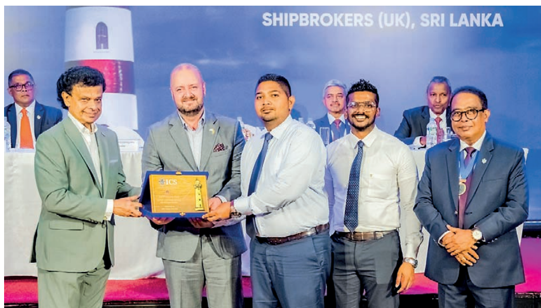
SAGT Import Customer Service Excellence Award 2025 - MSC Lanka (Pvt) Ltd