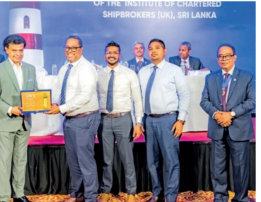
Best Shipping Agent - Customer Service - Colombo - USA Trade - MSC Lanka (Pvt) Ltd